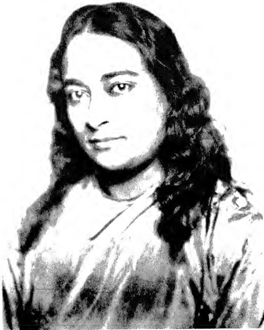
SRI SRI PARAMAHANSA YOGANANDA