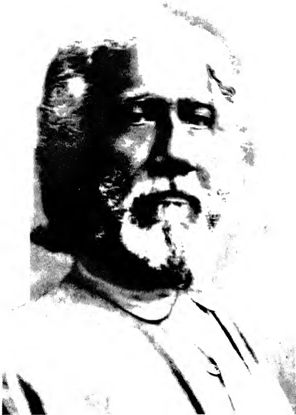
SRI SRI SWAMI SRI YUKTESWAR GIRI